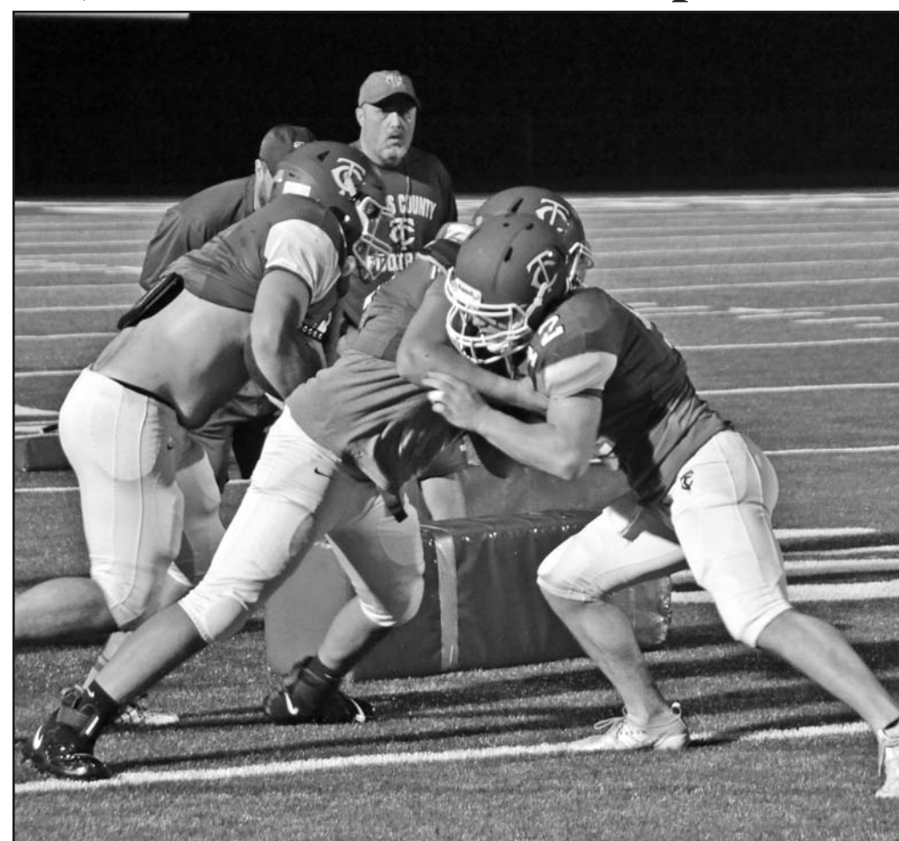
The Towns County Indians hosted their first official practice of 2020 at midnight on Aug. 7. Despite scrimmage games getting the axe, the season is still tentatively scheduled to open Sept. 4.